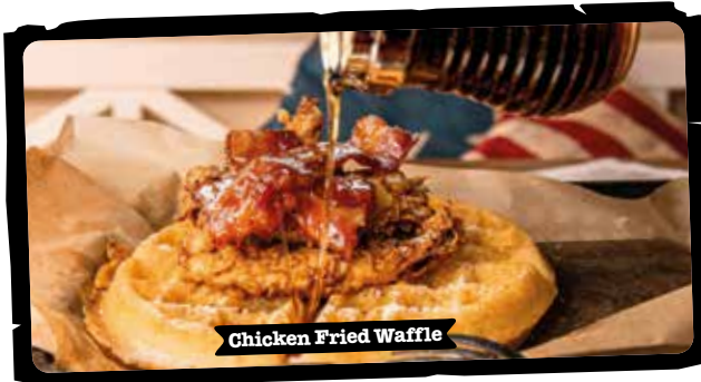
Chicken Fried Waffle

A freshly made waffle topped with Southern fried chicken & maple candied streaky bacon. Then just pour over some maple flavoured goodness.