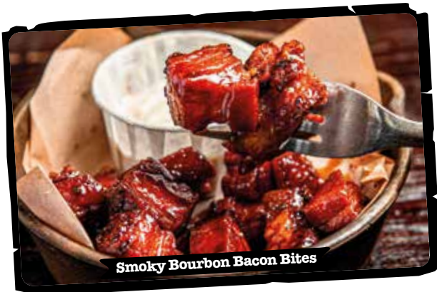
Smoky Bourbon Bacon Bites