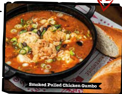
Smoked Pulled Chicken Gumbo