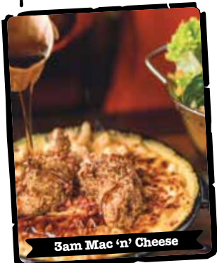
3am Mac 'n' Cheese

Topped with Cajun battered Southern fried chicken, bacon crumb & a maple drizzle.